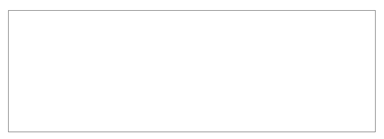
Figure 2. Example of a short caption, which should be centered.